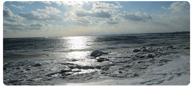
PLAGE ROCHELOIS, PORT CARTIER.