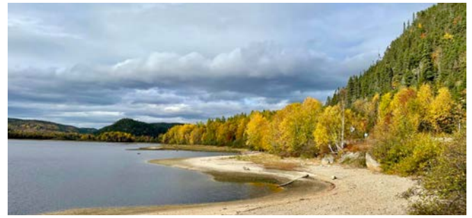
RIVIÈRES AUX ANGLAIS - BAIE-COMEAU