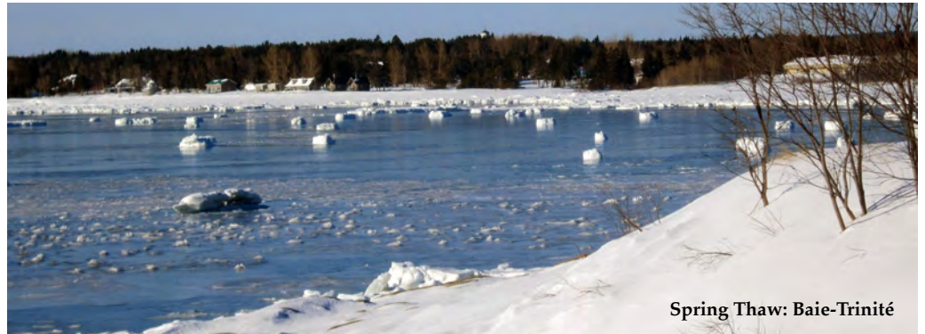
Spring Thaw: Baie-Trinité