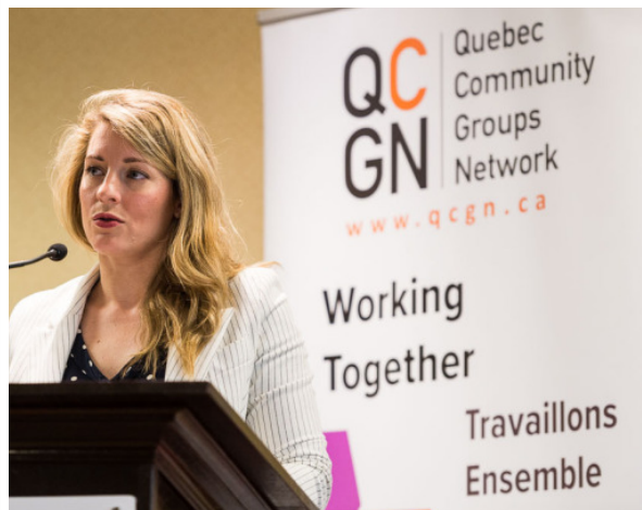
Canadian Heritage Minister Mélanie Joly