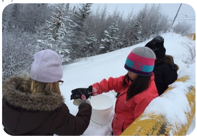
Ice Cream: students in Cycle 2 were reading stories about the Early Settlers. One story included a recipe for snow ice cream. Mrs. Kean's class went into a wooded area to find freshly fallen snow. The recipe required 4 teacups of snow, 1 fistful of sugar, 2 teacups of fresh cream and nutmeg.