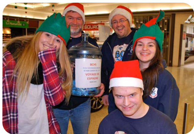
Maxi Wrapping Fund-raising: Secondary students were kept busy December 6-9 as they packed up groceries at Maxi in exchange for donations. Funds were collected for the Secondary V trip to Malaga, Spain, future participation in Encounters with Canada program and future school trips. Over $1600 was raised!