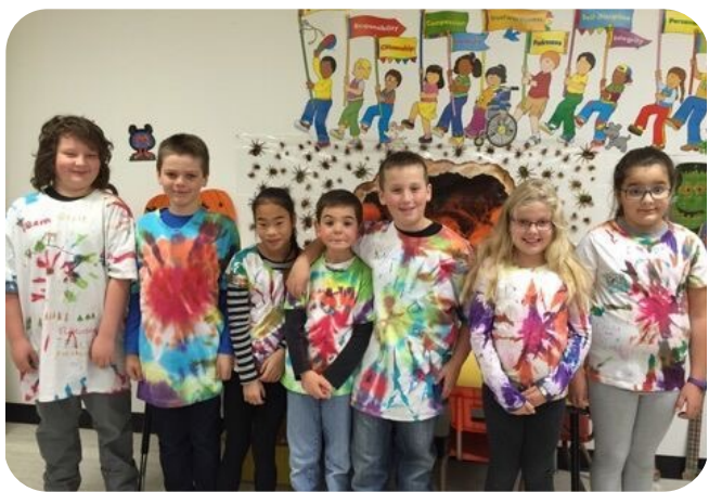
Tie-Dyed T-Shirts: To brighten up the winter months, the students in Cycle 2 drew a design on their t-shirts and then they tie-dyed their white shirts with bright colours.