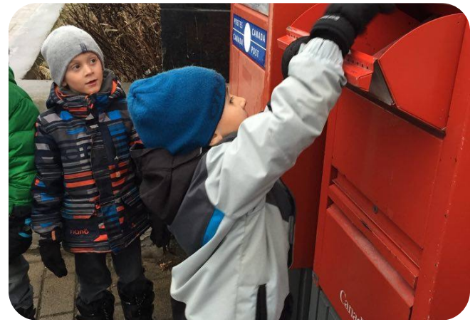
Cycle 1 students posted letters to Santa and waited eagerly for a reply.