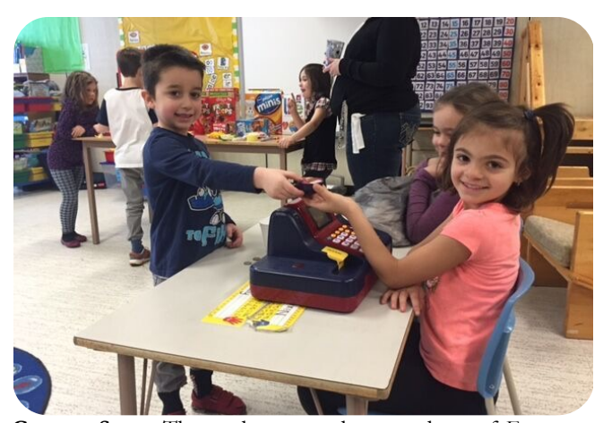
Grocery Store: The grades one and two students of Fermont School are learning about money. The students put their skills into everyday use in our grocery store!