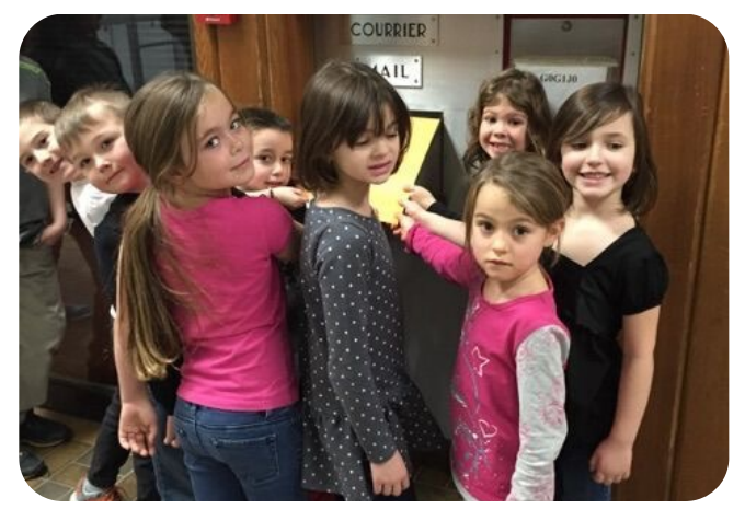
Concert Letters to Santa: The Pre-Kindergarten, Kindergarten and Grades 1 and 2 students enjoyed mailing their letters to Santa Claus.