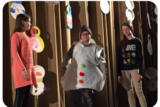
Christmas Concert: The annual Christmas Concert took place on December 16. The students sang songs, played boomwhackers and xylophones, and performed a couple of plays.