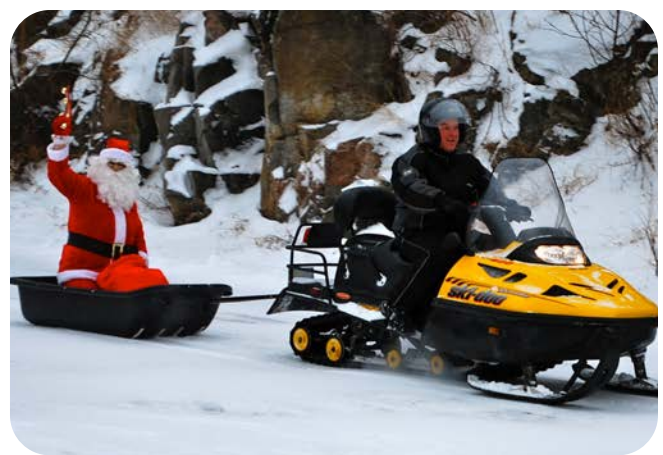
A Visit from Saint Nick: On the last day of school before the Christmas break, Santa took time out of his very busy schedule to pay BCHS a short visit. He arrived in style with toys for all the good little boys and girls!