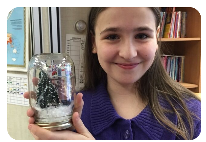
Snow Globes: We created snow globes using a small tree, snow and a picture of each student inside a mason jar. The students brought the cute snow globes they made home to their parents for a gift.