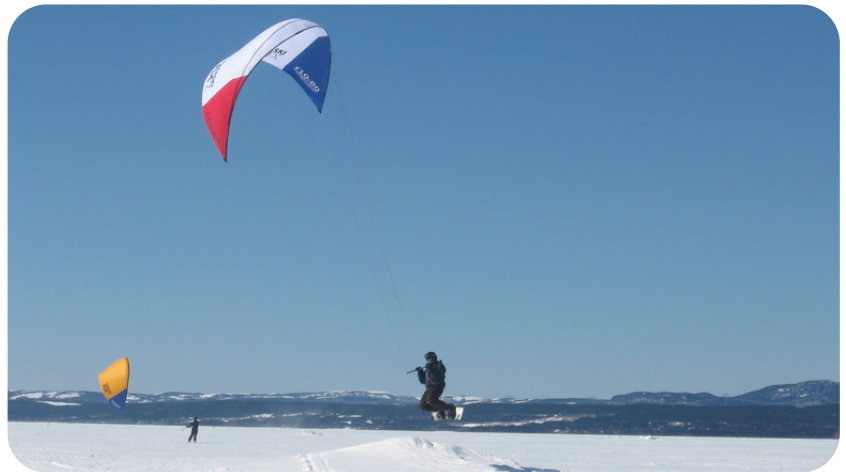
"Kite Sailing, Sept-Iles Bay "- L.Bouchard