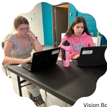
Vision Board Activity at QEHS

March 20, 2023 - International Day of Happiness