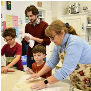
Baie-Comeau: Cookie Making with 20 BCHS Pre-K, K, Grades 1 & 2 students