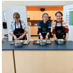
Sept-Iles: Cooking Activity with QEHS Students (which served about 120 people)