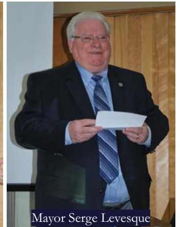
Mayor Serge Levesque