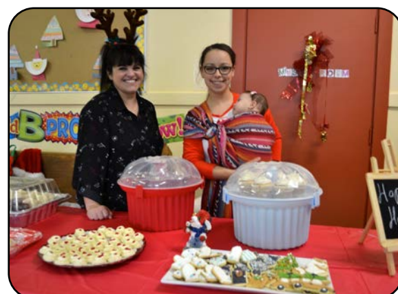
The BCCHS Home & School Association generously provided students, staff and parents with treats on the last day of school before the holidays. There were Christmas cookies, cupcakes, jello, squares, and hot chocolate.