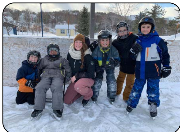
Students have been profiting from a multitude of outdoor activities this past fall and winter. It is wonderful to have these opportunities to promote outdoor sports and recreation!