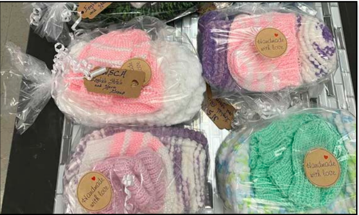
The Stitch N' Yarn group started off September 12 knitting and crafting and will continue meeting every Monday from 1:30 - 3:00 at the NSCA office, 598 blvd. Laure, in Sept-Îles. Feel free to drop-in and join in on the fun.

The ladies from this group are generously donating 10 knitted gift sets for mother and newborn baby which will include warm, cozy slippers for mom and beautiful hat and booties/mittens to bring the special little one back home. These packages will be taken to the Hospital Foundation who will then take them to the Sept-Îles Hospital Maternity Ward. Way to go and thank you for your generous donations.