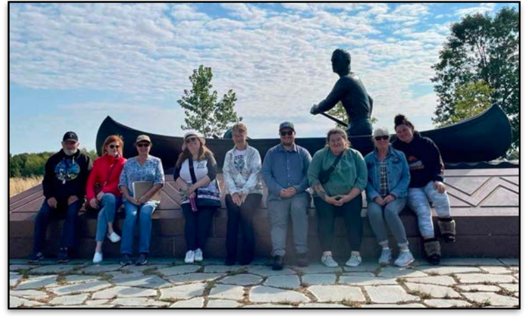
Themed "Getting to Know..." was the focus of our first staff retreat held in Baie-Comeau on September 6 and 7. With new staff and new programming in the works at the NSCA, it was a great welcoming and networking activity. In addition, it was a first time visit of the Sept-Îles staff to the Baie-Comeau office.

Staff acquired in dept knowledge on NSCA programming, the action plans, and discussed initiatives underway. Two great days of team building and planning with staff from the NSCA offices of the Baie-Comeau & Sept-Îles. What great networking!