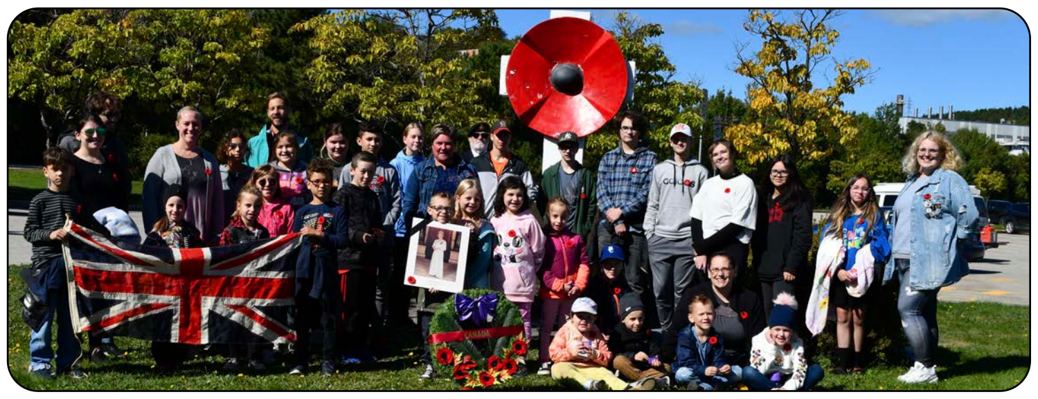
Students and Staff attended a commemorative assembly on Monday, September 19th at Parc des pionniers, honouring the life of the Her Royal Majesty Queen Elizabeth II. The activity was organised by the Royal Canadian legion Branch 003 <Quebec-North-Shore>.