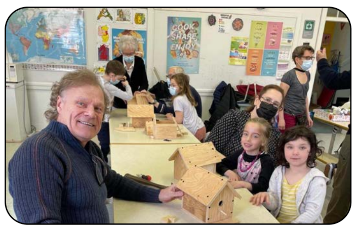
The 50+ Club of the NSCA teamed up with the pre-school and Cycle 1 students to build birdhouses.