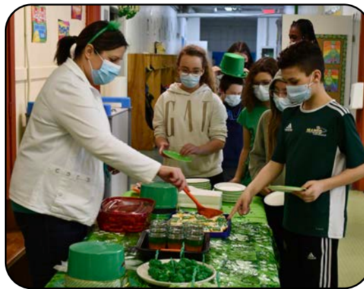
The BCCHS Home & School Association marked St. Patrick's Day with afternoon treats for students and staff. The Green Area was awash in green!