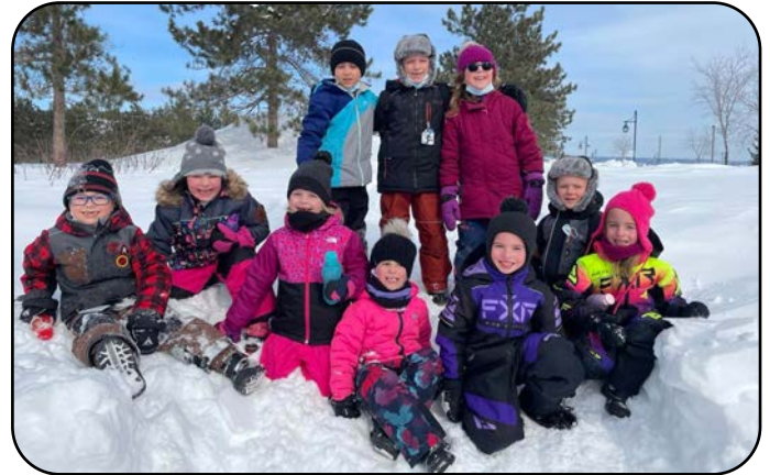
Elementary students were all smiles during BCCHS's winter carnival day.