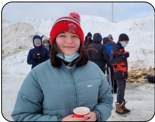
BCCHS secondary students gave a hand during the International Day of Women's Rights in Baie-Comeau on March 8th.