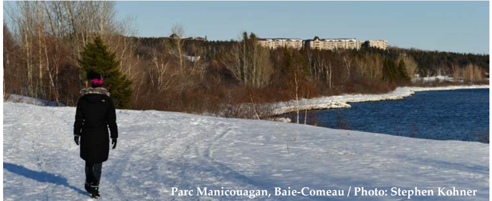
Parc Manicouagan, Baie-Comeau