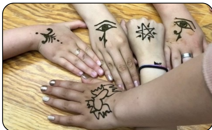
A henna tattoo artist visited our school.