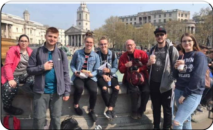
London Calling! Secondary IV-V students spent a week in London, England in mid-April. So much to see: Tower of London, Globe Theatre, Windsor Castle, Westminster Abbey, St. Paul's Cathedral, Churchill War Rooms...