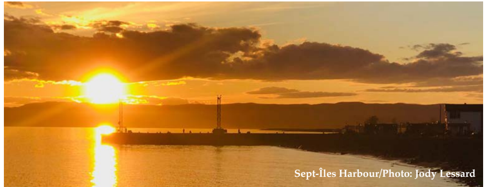
Sept-Îles Harbour