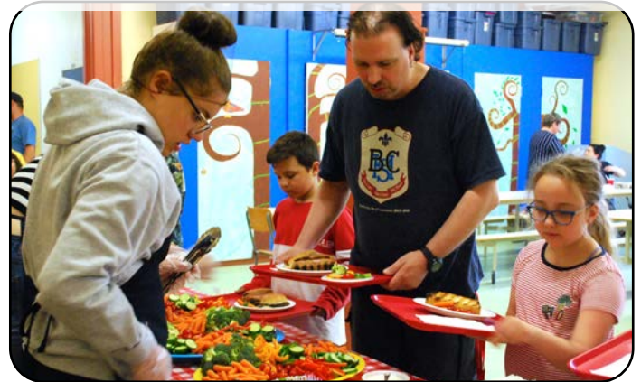
BCCHS Home & School Association cooked up a storm on June 14th for the Year-end BBQ lunch. On the menu were hot dogs, hamburgers, fresh fruit, veggies and juices. There was a great turnout of students, staff and parents.