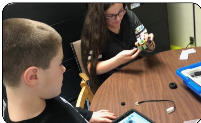
Our students have been working on robotics throughout the school year. The students have been manipulating the movements of the robots using coding on an iPad. We are helping to prepare our students for their future!