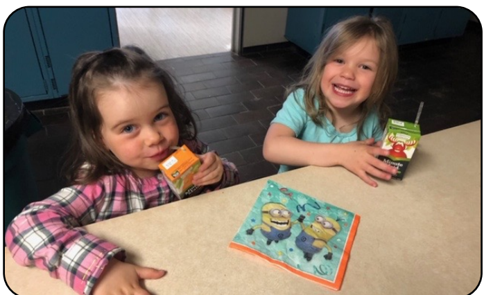
Two new students visited us during the Welcome to Kindergarten night. We ate pizza and played a lot of fun games with all of the family members. The students, parents and teachers showed off their dance moves during the Movement and Music centre.