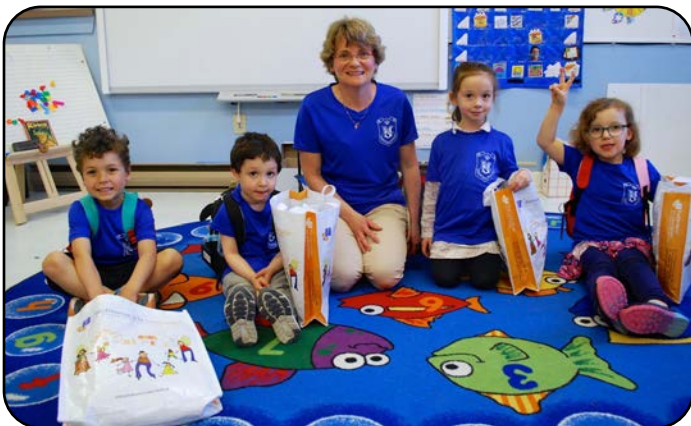
BCCHS in partnership with The Learning Partnership organized a "Welcome to Kindergarten" meeting for new pre-school students and their parents. The evening was filled with time for play, learning and healthy snacks!