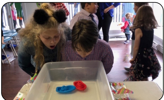
After the Spring Concert the students played games and won prizes.