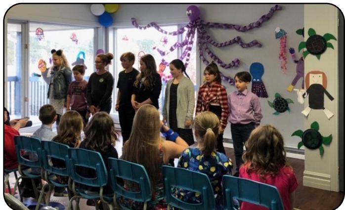
June was a very busy month at Fermont School. Our students had their annual Spring Concert and barbecue on June 6.