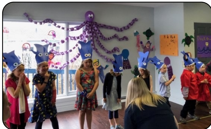
The students in Kindergarten to Grade 3 sang the song Baby Shark.