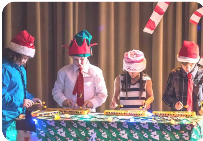
The Grade 3 students played Jingle Bells, Old Santa Claus, and Twinkle Twinkle Little Star on the xylopipes.