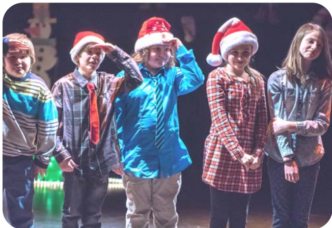
Excited children were looking for Santa.