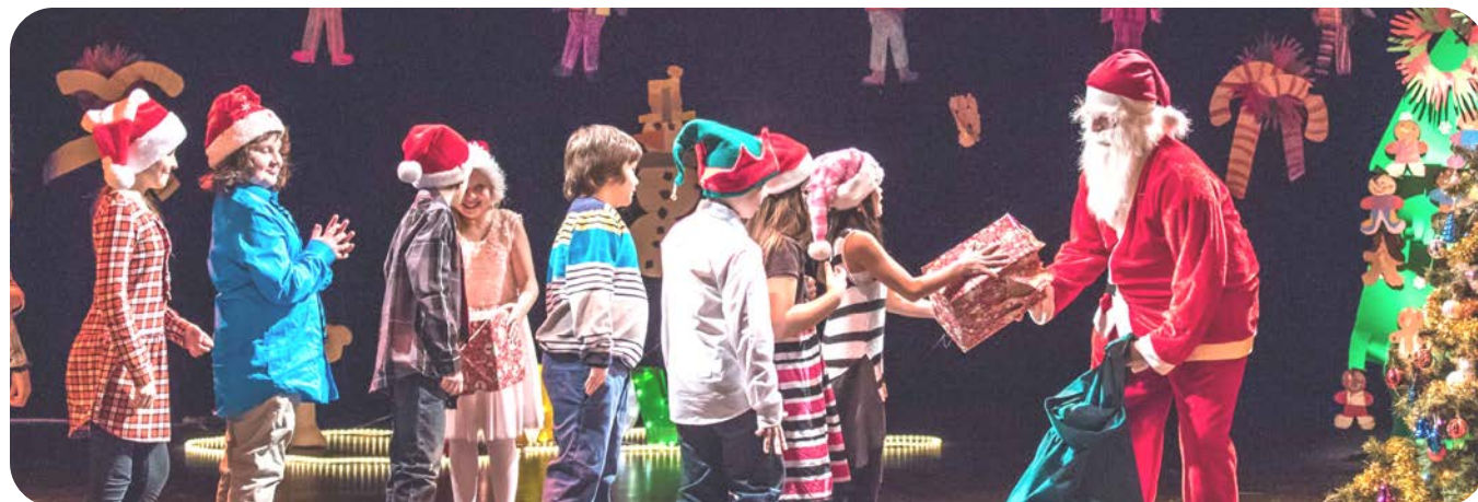
Santa finally arrived with gifts!