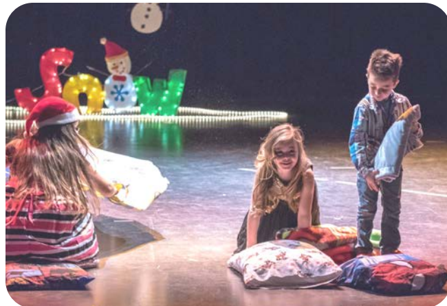
The tired children were getting ready for bed.