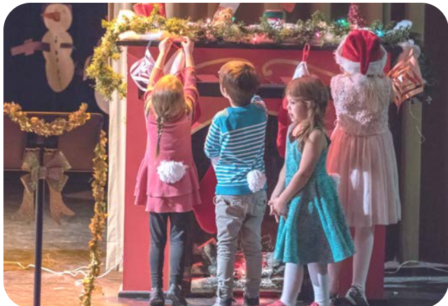
The stockings were hung on the fireplace.

Our annual concert at Fermont School took place on Thursday, December 11. The students from Pre-Kindergarten to Grade 5 acted in the play, 'Twas the Night before Christmas . The children sang songs, recited poems, and played the bells and xylopipes. Parents brought refreshments for the reception. The students gave great performances and the audience enjoyed the show. We had another successful concert!