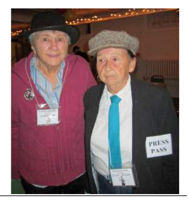
North Shore Community Association