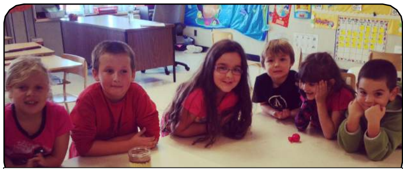
Science has been coming alive in Ms. Hynes' class during the unit on Living Things. The students are trying to grow, and observe the oldest Prehistoric living things called Triops. They have been on Earth before the Dinosaurs roamed, and they are still living today.