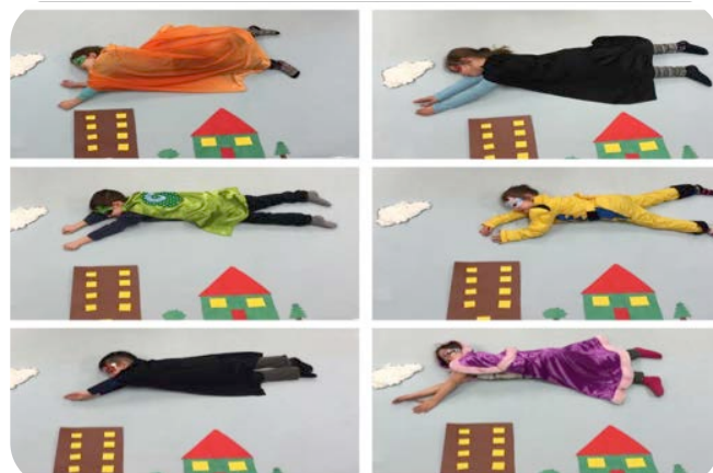
Ms. Langdon's Pre-Kindergarten and Kindergarten students at Fermont School were seen flying high in the sky at their Superhero themed Lunch Club!