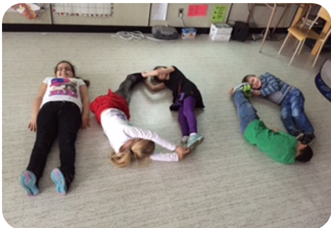
The 100th Day of School was a big success as the classes had several challenges to complete and found 100 ways to represent the number 100!