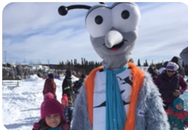
Our students went sliding, drank hot chocolate and watched the dog sled teams start the race during the Taiga Carnival held between March 19-22.