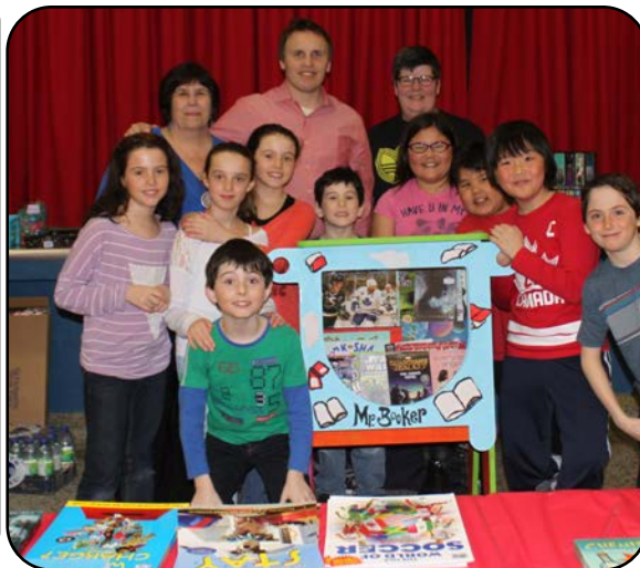
“Croque -livres launch at Flemming School