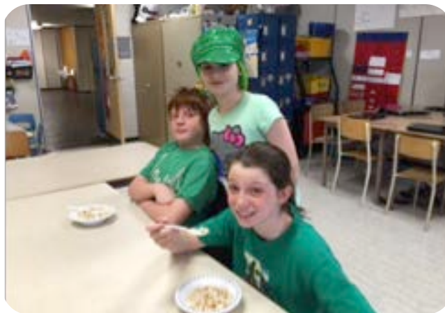
The Grades 3 and 4 class kicked off St. Patrick's Day activities by writing their own Leprechaun Limericks and all the students in Pre-Kindergarten to Grade 6 ate a Leprechaun's breakfast! Magically Delicious!