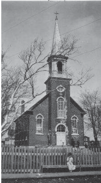
Notre-Dame de L'Assumption Church in Betsiamites

We are now entering the Manicouagan area of our North Shore trip. The distance covered up until now has been about 100 kilometres; just enough to give us a pre-taste of what awaits us. We travel through St. Marc la Tour and Colombier and reach Islets Jeremie, a long time pilgrimage site for the native and non-native populations of the region. From there we go on to Betsiamites the largest Innu reservation on the North Shore. The village rests on the delta of the river of the same name and is a vibrant community. Although over the years the relationship between native and white communities has degraded somewhat this population is stable and largely unemployed. With nowhere else to go they are trying to develop the land that they have and to retake land that is now government claimed property. The Papinachois Centre is a good example of the spirit of the Innu people. Here we can observe life the way it was before the arrival of the white man and dine at the fine restaurant. You will need to reserve but it is a treat with wild game and wild berries prepared in style.