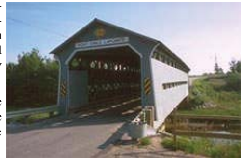
Covered Bridge at Baie-St Ludger

Pointe aux Outardes is on the St. Lawrence just south of Chutes aux Outardes. One particularity of this village is that it has the last covered bridge on the North Shore. This village also includes Les Buissons and Baie St-Ludger. Les Buissons has a modern Agricultural Research Station that works on seed potatoes and wild berries and Baie-St-Ludger has been named as a world heritage site by UNESCO for its fine therapeutical clay and the site on which it is mined by Argile EauMer.