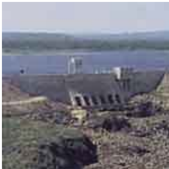
Outardes 2 Power Station

Rageneau is the next stop on our itinerary. This village looks over the St. Lawrence and has several islands. Founded in 1870 but discovered in 1699 agriculture has always been the staple of the inhabitants of Rageneau. A short lived sawmill was in operation for close to 10 years but is now closed so blueberries and potatoes are the mainstay. A small trout farm also has made its debut and is quite successful with unlucky fishermen.