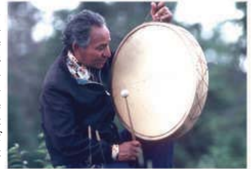
Native drummer at Papinachois.

We are now entering the Manicouagan area of our North Shore trip. The distance covered up until now has been about 100 kilometres; just enough to give us a pre-taste of what awaits us. We travel through St. Marc la Tour and Colombier and reach Islets Jeremie, a long time pilgrimage site for the native and non-native populations of the region. From there we go on to Betsiamites the largest Innu reservation on the North Shore. The village rests on the delta of the river of the same name and is a vibrant community. Although over the years the relationship between native and white communities has degraded somewhat this population is stable and largely unemployed. With nowhere else to go they are trying to develop the land that they have and to retake land that is now government claimed property. The Papinachois Centre is a good example of the spirit of the Innu people. Here we can observe life the way it was before the arrival of the white man and dine at the fine restaurant. You will need to reserve but it is a treat with wild game and wild berries prepared in style.