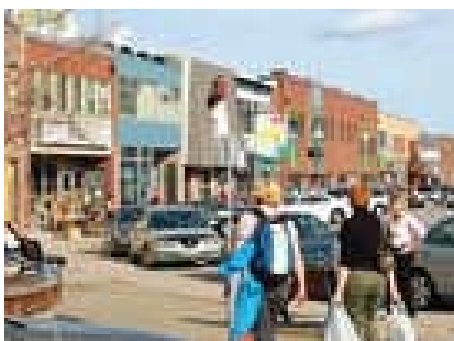
Lasalle Blvd. Main street Baie-Comeau