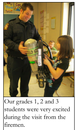
Our grades 1, 2 and 3 students were very excited during the visit from the firemen.

Did you ever have a bad day? Does a smile make you feel good? Students at Fermont School are helping build a community where feeling good is number one priority. Oftentimes, we focus on the negative impacts bullying and unkind thoughts/actions have on our students, but what does good behaviour look like? How can we instil a positive outlook on life? Bucket Filling is a tangible task for students.