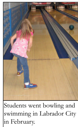
Students went bowling and swimming in Labrador City in February.