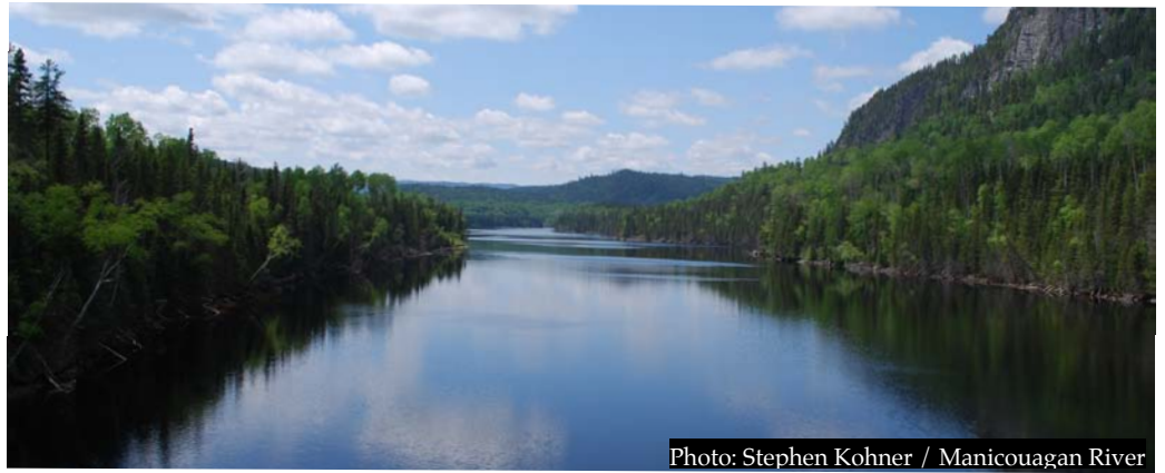
Manicouagan River