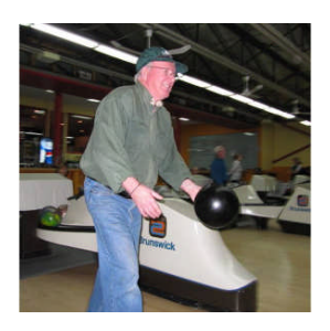
"I feel a strike coming!"