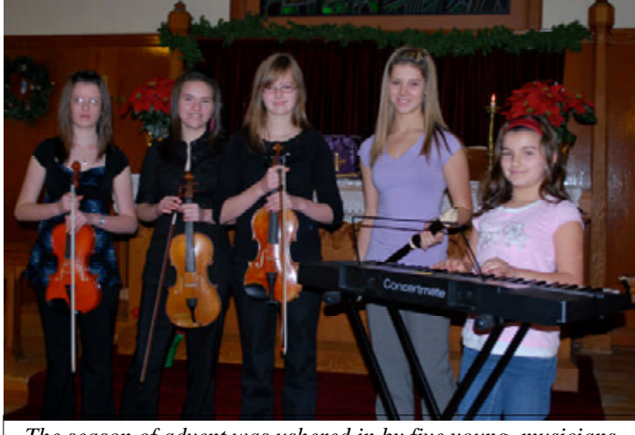
The season of advent was ushered in by five young musicians who performed Amazing Grace