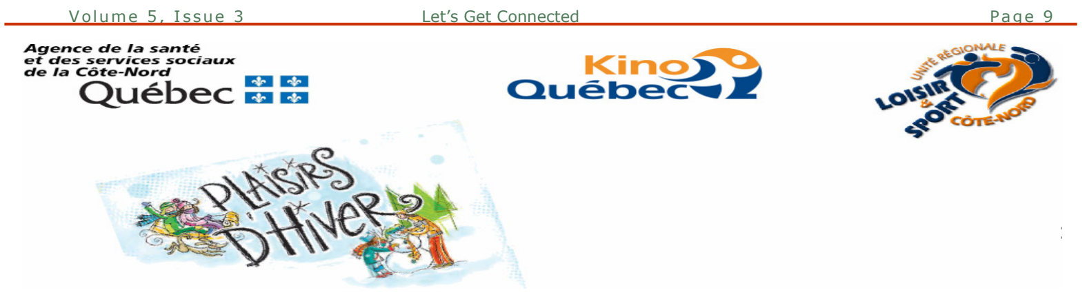
Kino-Québec - Pla isirs d'hiver Festival

Baie-Comeau, le January 12, 2009 – As part of the 2009 Plaisirs d'hiver Festival, KinoQuébec would like to invite North Shore municipalities, schools, and organizations to suggest activities aimed at staying physically active during the winter months, namely from January to mid-March.