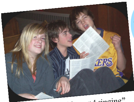
“Children laughing and singing”