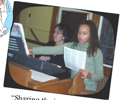
“Sharing the joy of music”

The students from Fermont School exchanged letters with a French Immersion class in Labrador City, NL. Our students are mainly Francophone so they wrote their letters in French and the class in Labrador City wrote their letters in English.