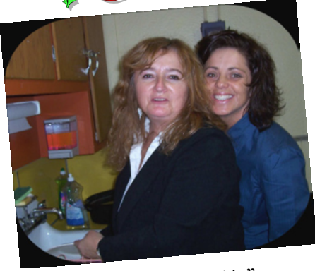
“The joy of fellowship”