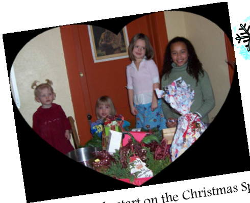
“Getting an early start on the Christmas Spirit”