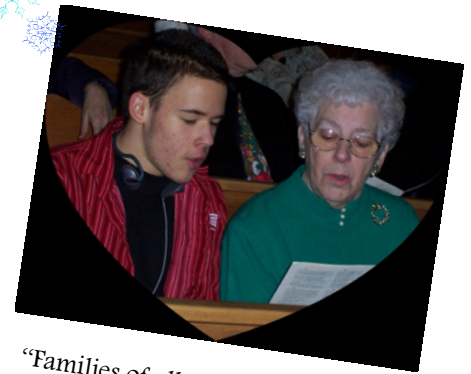
“Families of all ages getting together”