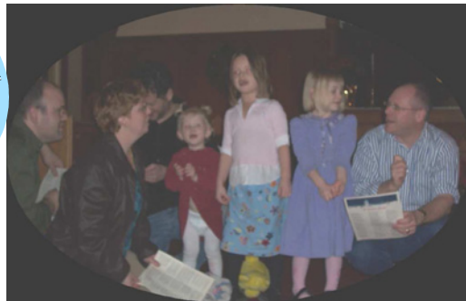
“Welcoming new faces to our community”