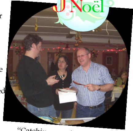
“Catching up with old friends”