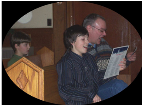
“The fun of Christmas Caroling”