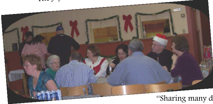
“Sharing many different and wonderful dishes”