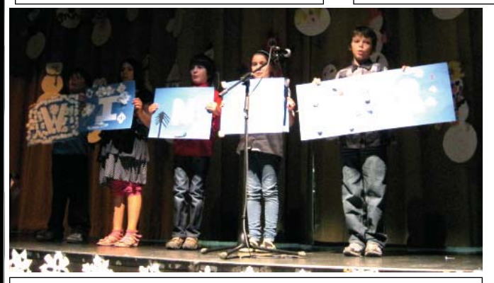
The students in grades 3 and 4 started the show with a Winter Acrostic Poem.