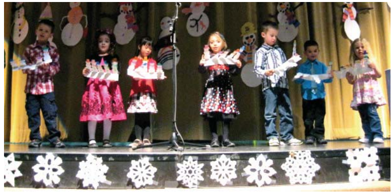
The Pre-Kindergarten and Kindergarten children sang the song, Five Little Snowmen.