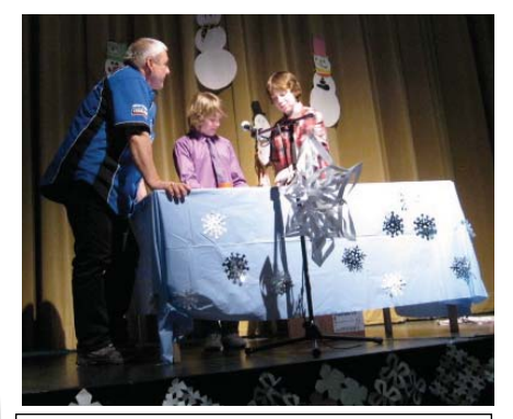
Audience members were asked to volunteer during the magic show.

The Fermont School students had their Winter Concert on Wednesday, December 14. The students from Pre-Kindergarten to Cycle 3, Year 2, sang songs, played hand bells and xylophones, read poems, and the older students performed magic tricks. Parents brought food and a lot of people attended the event. Everyone had an enjoyable evening.